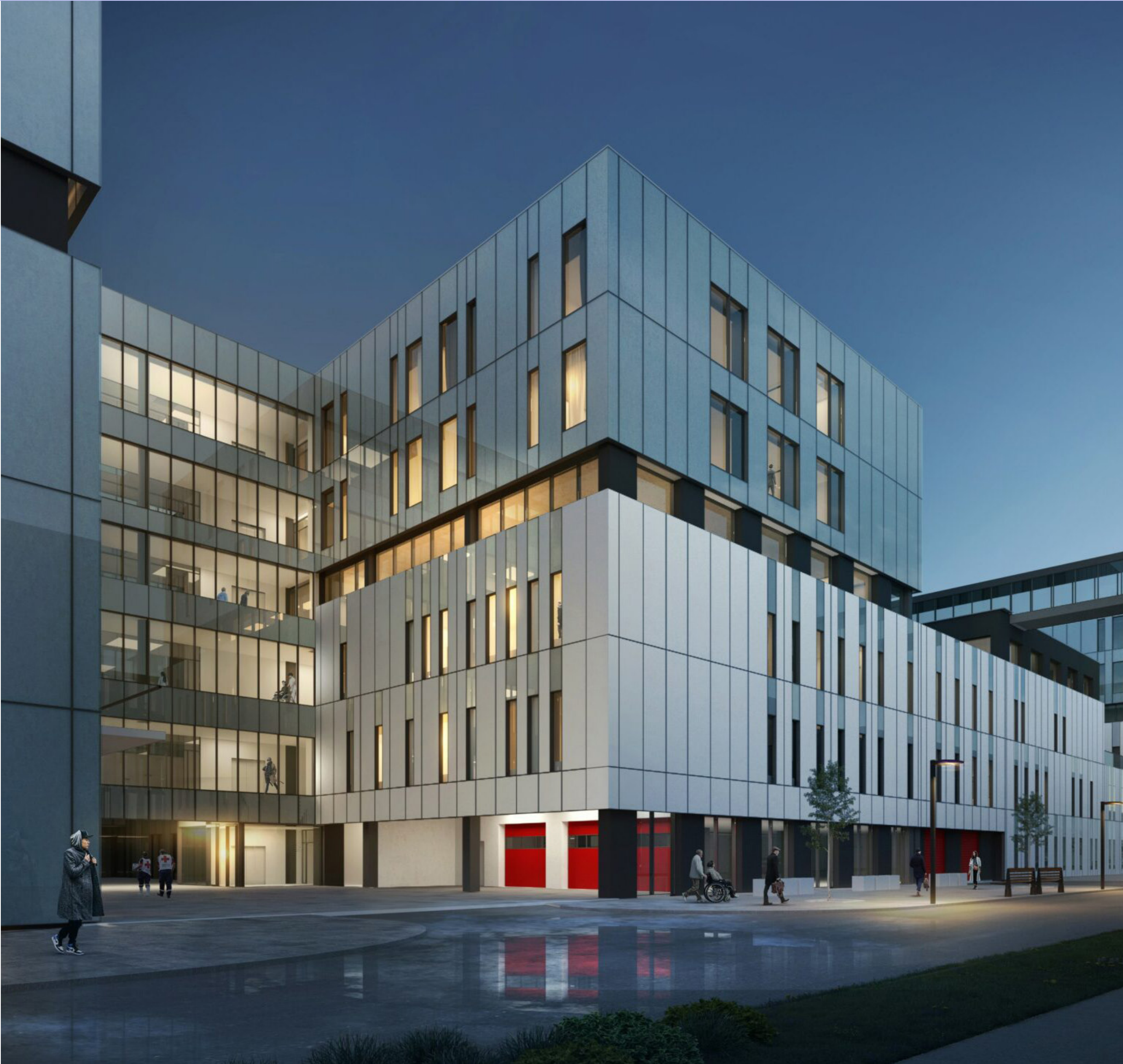
Landspítali University Hospital | Reykjavik, Iceland

2022 also saw a focused continuation of the digitalization that is essential for our business. For example, we launched our new 4D tool that enables stakeholders to easily view progress data on a project.